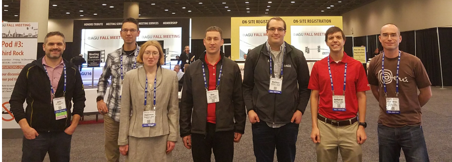
HamSCI at the 2016 American Geophysical Union Meeting